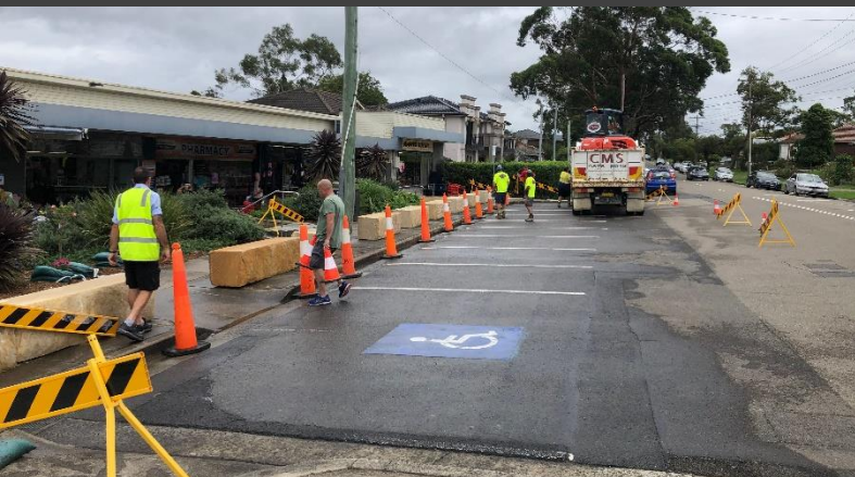
Donation of sandstone blocks at North Epping Shops