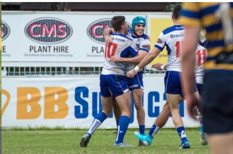
20-year partnership with Eastwood Rugby