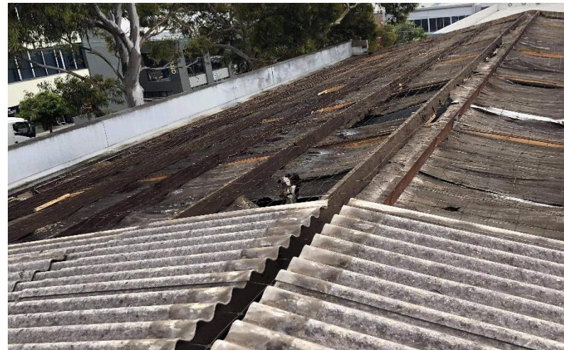
Whiting Street, ARTARMON

Project: Upon prepping the subgrade for a new basketball court at Claremont College it was to our surprise to find contaminated fill under the previous softfall. CMS acted promptly and professionally to set up exclusion zones and evacuate surrounding classrooms to treat and remove the contaminated material.