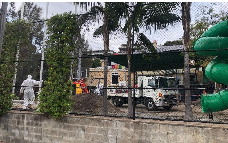
CLAREMONT COLLEGE, RANDWICK