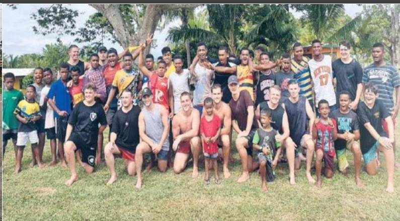
Recent sponsors of Korovutu Fijian Men's Rugby Team