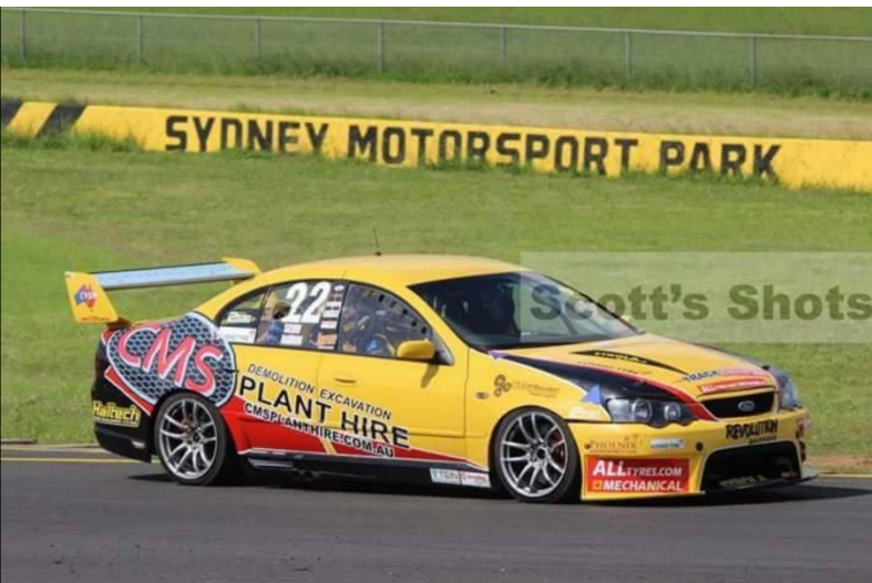
Proud sponsors of the STROLA Racing Team

At CMS Contracting & Plant Hire we are committed to giving back to the community